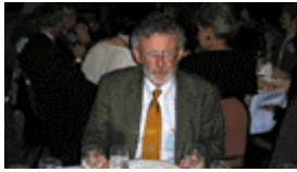
Pepper looks a bit bemused.