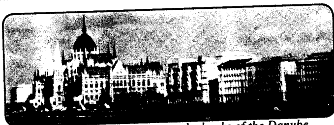
The Budapest Parliament on the banks of the Danube.