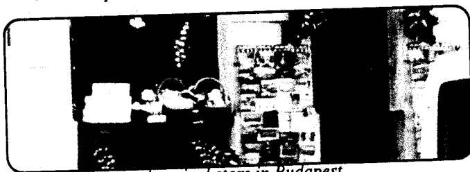
A typical store in Budapest